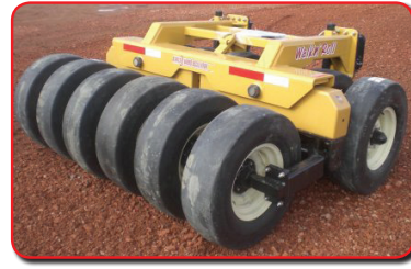
The unit shown is a WR90 Twin Frame Oscillator Walk 'n' Roll packer/roller.