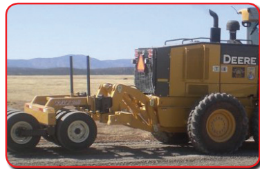
The unit shown is a WR75 Straight Frame Walk 'n' Roll packer/roller.