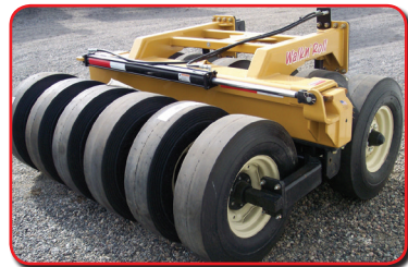
The unit shown is the WR90RL. This unit will Side-Shift 24" to the Right or Left.

We also build a WR75R and a WR90R Hydra-Slide. These units Side-Shift 36" to the Right