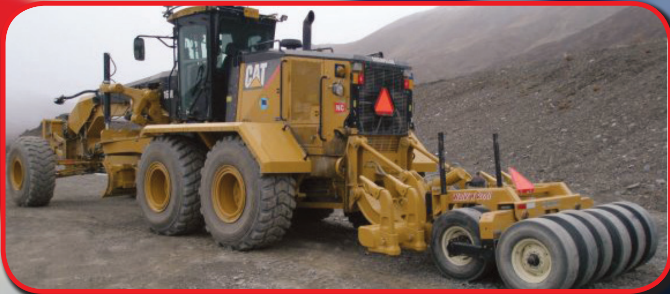
This is a WR90 Walk 'n' Roll Oscillator mounted on the rear of a 60,000lb. 16M Caterpillar Motor Grader. The unit is working in Alaska.

Don't try this unless you have a Walk 'n' Roll packer/roller